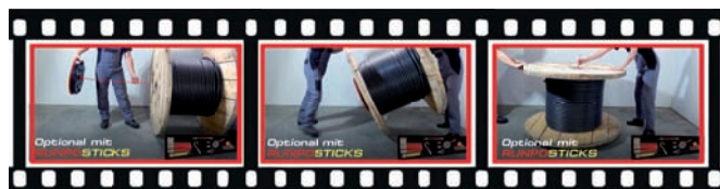
Helps tilting of large drums on to the X BOARD