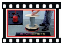
Fix light drums